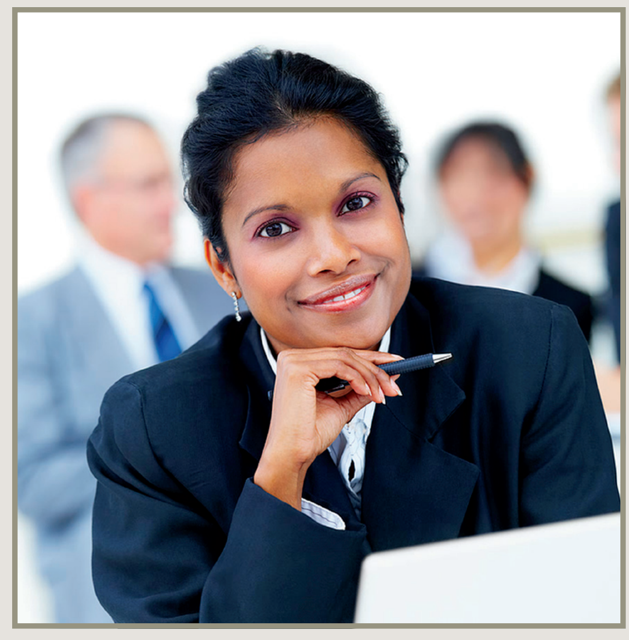
Experience. Talent. Partnership.